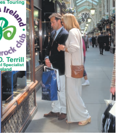
Shopping in the Burlington Arcade, London

Discover the wonders of London on a 3-night stay or longer. These programs combine a selection of fine hotels with airport transfers, an open-top bus voucher to take you all around the city, a theater pass for a selection of shows and a compact guide with discounts. These arrangements are perfect for combining with a coach tour or adding a night or two at the beginning or end of your vacation.