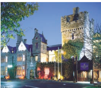
Clontarf Castle Hotel, Dublin

Enjoy a castle hotel stay in Dublin with this program. Peak season supplement to Tier 1 prices are only $4 per person per night.