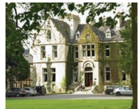
Cahernane House Hotel, Killarney