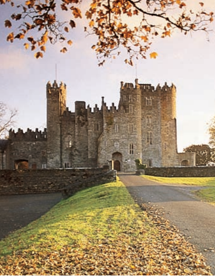
Stay at Kilkea Castle Hotel (Tier 2)

Find a world of understated elegance and warm service at Manor House Hotels. For a memorable Irish vacation look at these special castles or country house hotels, all of which are privately owned and vary in size and style.