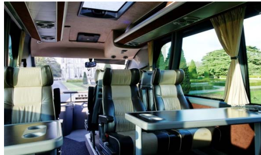
Mercedes Executive 16 Pax Midi Coach