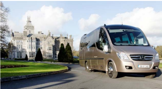
Mercedes Executive 16 Pax Midi Coach