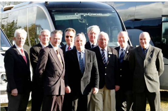
Driver Guides 2011

For additional information and availability, please contact Linda Terrill.