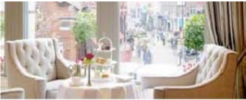
The Westbury Dublin