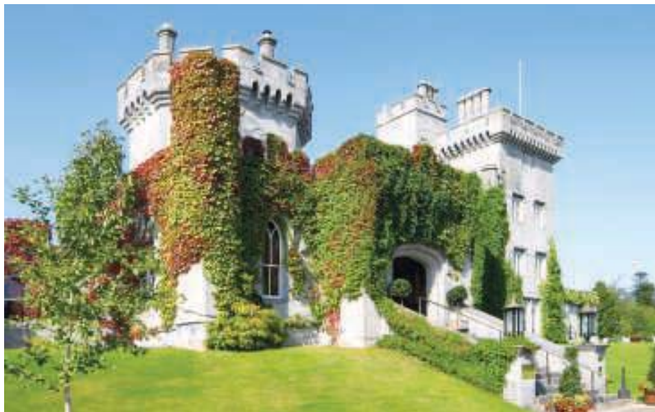
Stay at Dromoland Castle, built in the 16th century and renowned as one of Ireland's premier castle hotels

Insight has compiled a compendium of luxury hotels, which tastefully fuse traditional charm and atmosphere with modern design. Stay in elegantly appointed rooms, dine in culinary splendor and enjoy exemplary service from friendly and helpful staff.