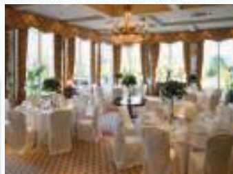
Enjoy 5 star fine dining at Dromoland Castle