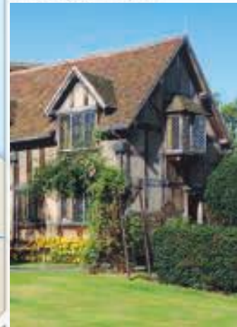
Visit Shakespeare's Birthplace