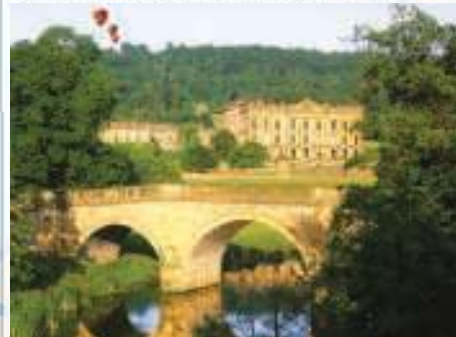
Visit the historic stately home of the Dukes of Devonshire