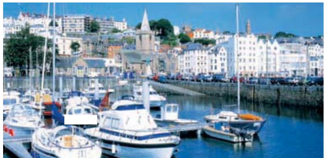
St Peter Port Guernsey

Sadly your tour comes to an end after breakfast. Take your private transfer to the airport for your home bound flight. (FB)